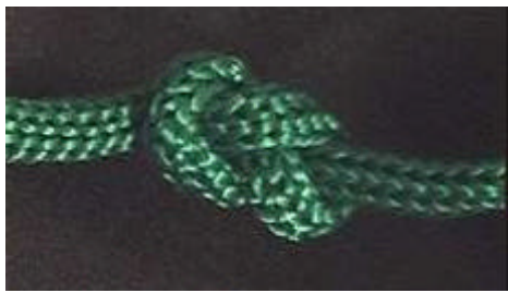
Figure of Eight

This is essentially formed when you do an extra turn to an Overhand Knot. It is a more solid knot than the Overhand Knot and